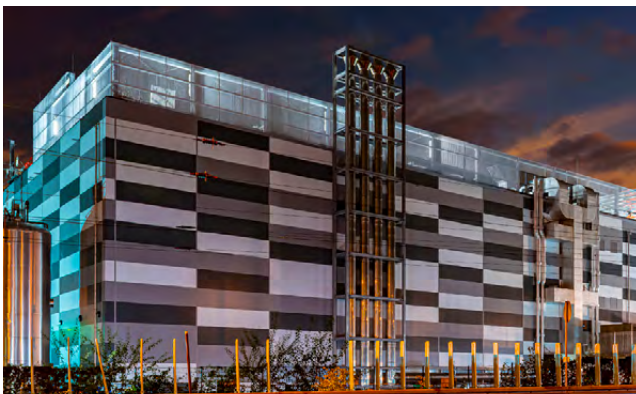
data centre | BRUCHA panel fire protection incl. corner panel