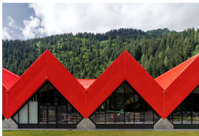
gas station gastro-shop | BRUCHA panel façade RAL 3020