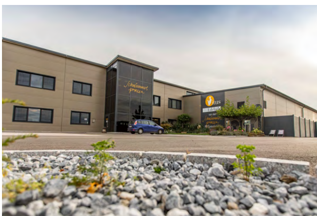
mushroom growing | BRUCHA panel façade Premium RAL 1035