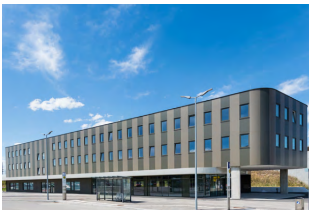
station building | Radius façade panel, vertical mounting