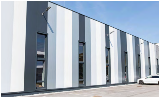
production area | BRUCHA panel façade PIR+ & fire protection