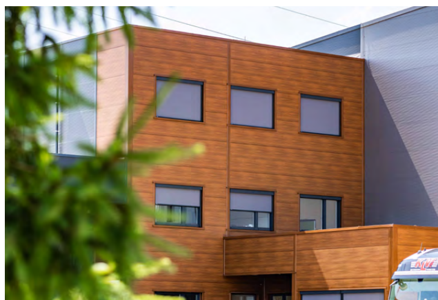
paper mill | façade Premium in wooden optics & RAL 9006