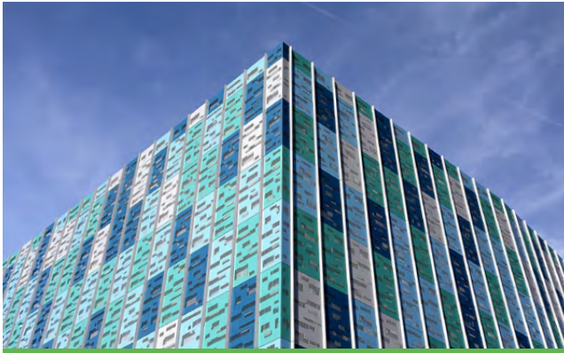
indoor swimming pool | BRUCHA panel Carrier-System