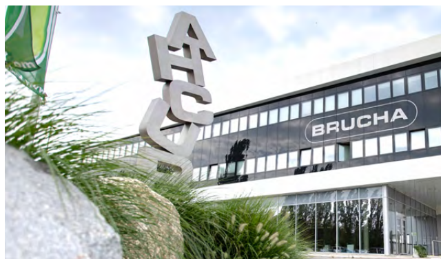
BRUCHA Headquarters/Production in Lower Austria