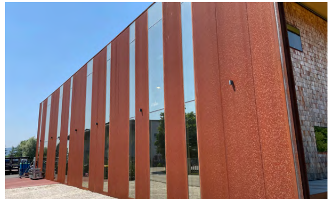
commercial building | façade panel corten steel surface